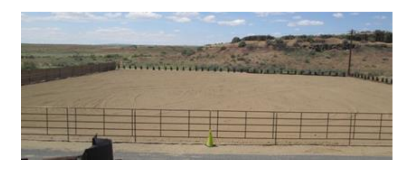
2019 New facility 4 dry lot pens, South campus 143'x140' out-door arena near barn.