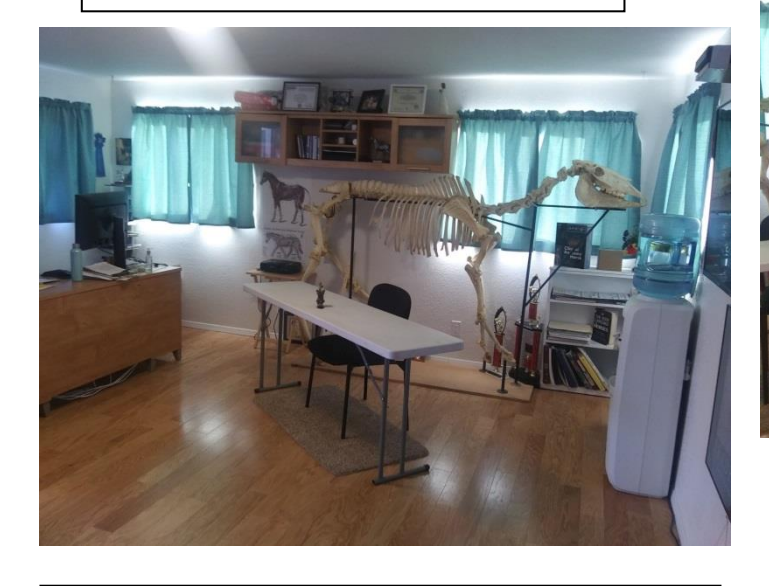
TV for viewing videos