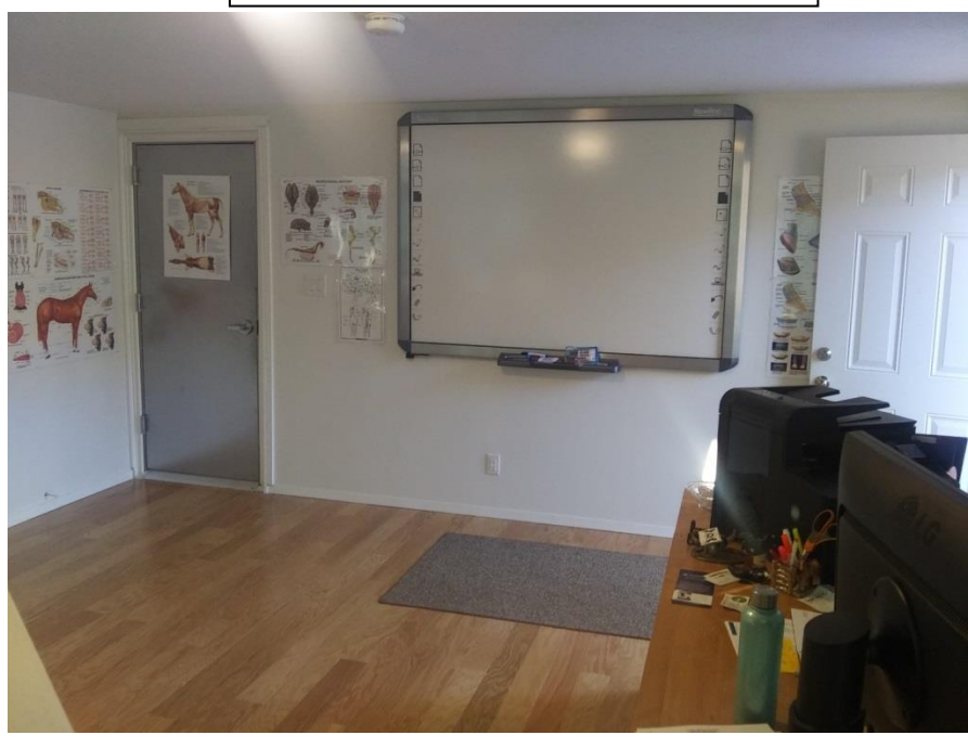
Entrance From Outside