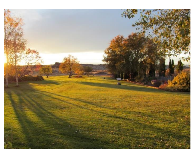
Park and graduation stage.